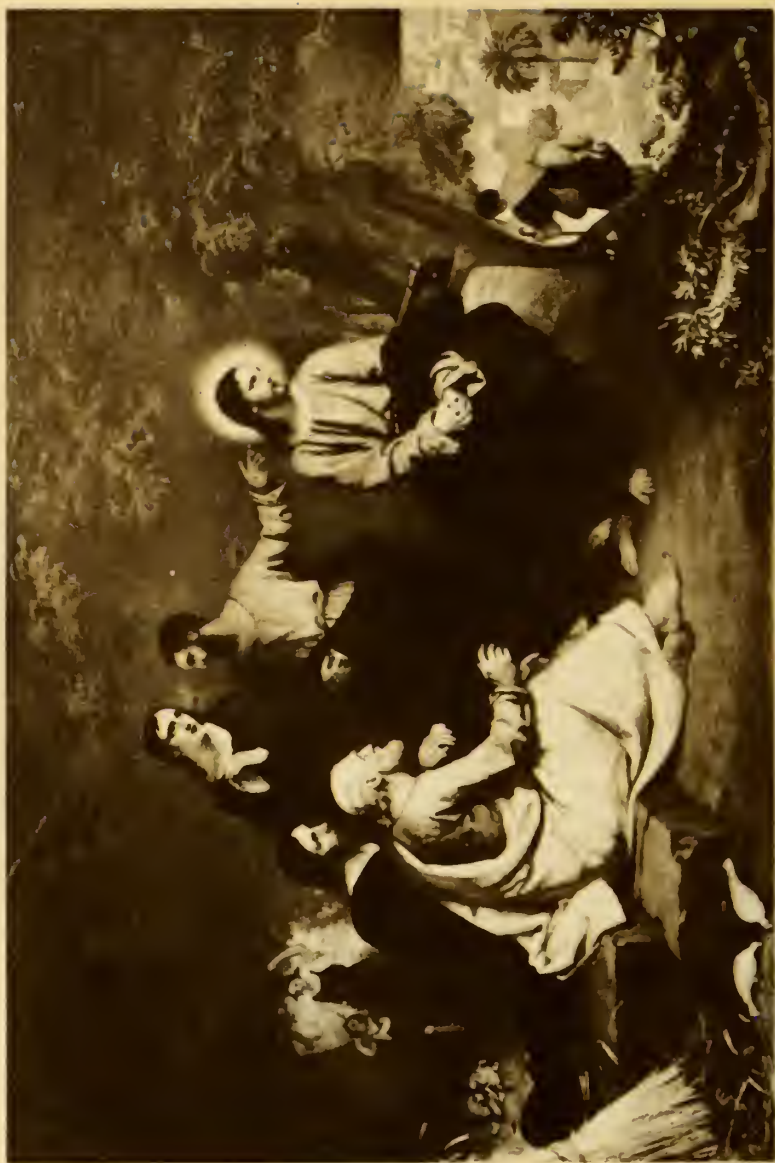
"Seeing the city He wept over it."